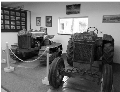
Lindeman building display of a Lindeman crawler and a John Deere BO tractor