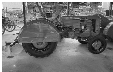
A fully restored 1945 Case VAO