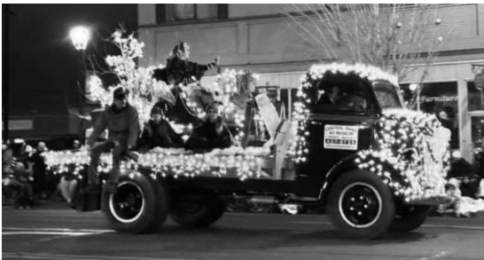
The COE in one of the many lighted parades in the valley

It is now “Lighted Implement Parade” time. Some of our volunteers decorated a sleigh on the bed of the 1946 Ford cab-over-engine flatbed truck. This will be driven in most of the lighted holiday parades throughout the valley. Our volunteers will also occasionally join the caravan of large lighted trucks that roam through the neighborhoods in communities around the area every night. ‘Tis the season!!!