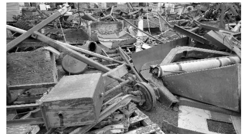
A big project remains to recycle the scrap pile