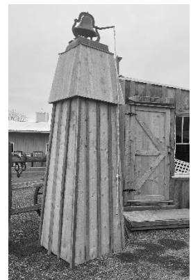
Completed school bell tower ready to call the children to classes