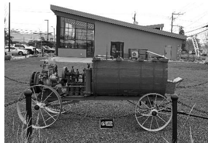
The Bean sprayer is displayed in front of the new library and community center at the Union Gap Civic Campus.