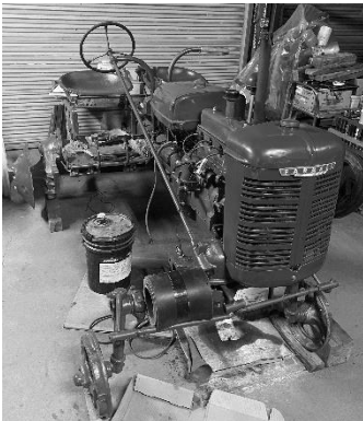
A two-seat Farmall tractor is being created