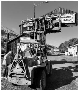
Repairing the entrance archway