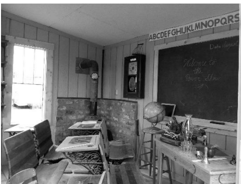
The new schoolhouse is ready and waiting for a visit from students when field trips begin in the spring.