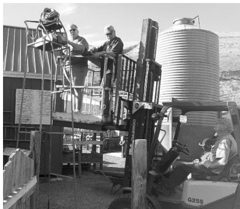
installing the school bell at the top of the bell tower