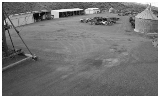
Bill has emptied the area north of the Klingele shop and the Gallion building