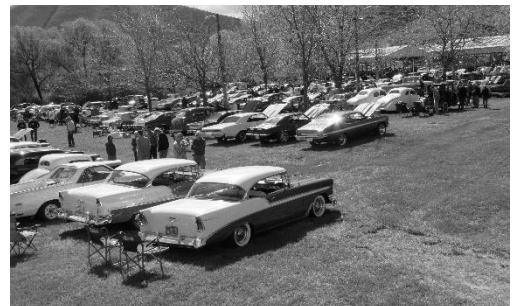
300 vehicles registered for the 2024 Old Steel Car Show. Any wheeled vehicle can be shown.