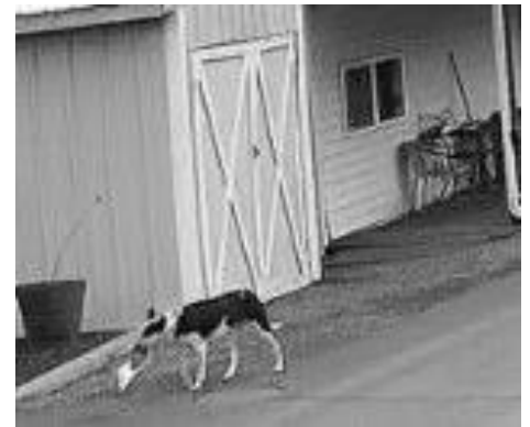
We had a porch pirate! Shadow couldn't resist taking a package delivered to Jerry. It was several days before it was found among the shrubs, wet, with a corner chewed open.