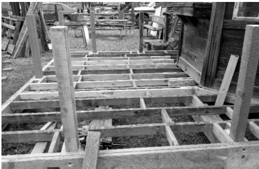
The Farmstead depot is getting a new deck