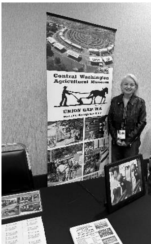
Cheryl represented the museum at the Cherry Institute